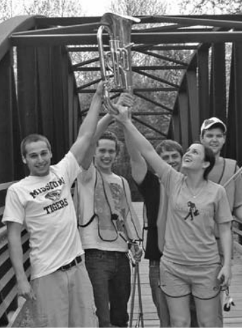
Alpha Phi Omega

May volunteers of the month have taken “spring cleaning” to a whole new level. As members of the Mizzou Beta Eta chapter of Alpha Phi Omega (APO), a national co-ed service fraternity, they have spent many hours over the past two years, rain or shine and in ice and snow, collecting trash and debris from streets and waterways.