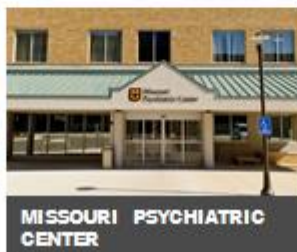
MISSOURI PSYCHIATRIC CENTER