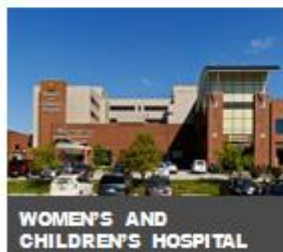
WOMEN'S AND CHILDREN'S HOSPITAL