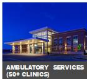
AMBULATORY SERVICES (50+ CLINICS)

www.MUHealth.org • Facebook/MUHealthCare • Twitter.com/MUHealth • Instagram.com/MUHealth