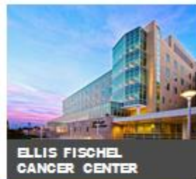
ELLIS FISCHEL CANCER CENTER