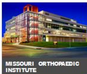
MISSOURI ORTHOPAEDIC INSTITUTE